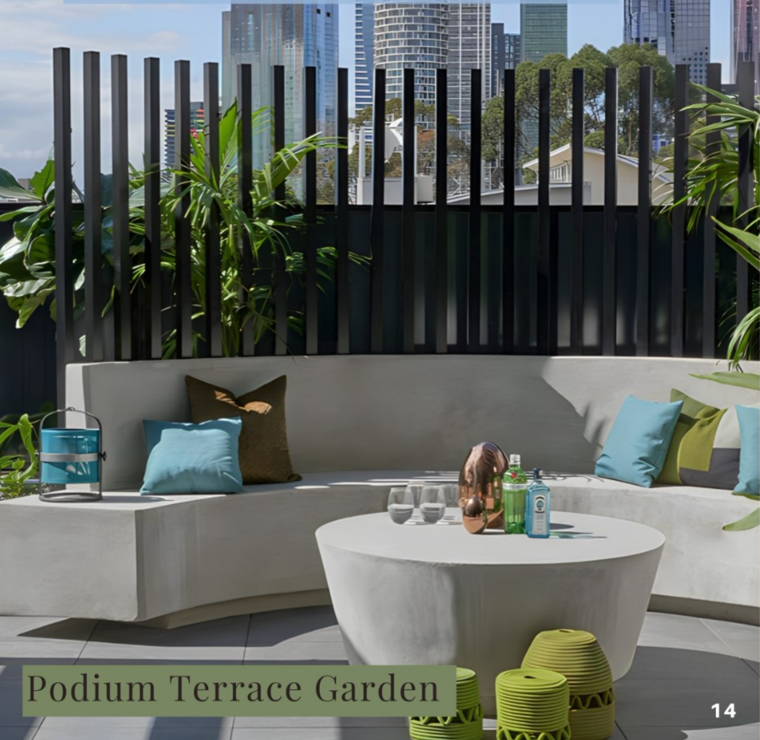
Podium Terrace Garden

Flagstaff Hill is designed with sustainability in mind, featuring an extensive solar array over the entire roof parasol, screening the building plant, creating a crafted “fifth facade” and reducing the urban heat island effect with the extensive roof gardens. The solar arrays also offset energy consumption within the project.