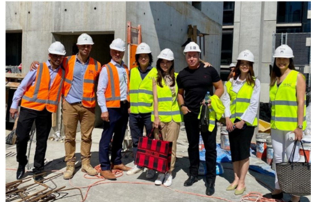
The hardworking team at UAG